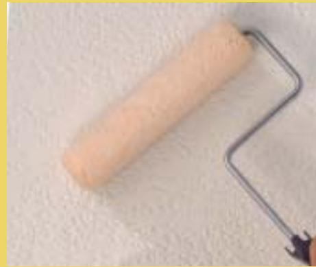
Seals crumbly textured finishes