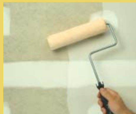
Seals in chalky paint, joint compound and spackling