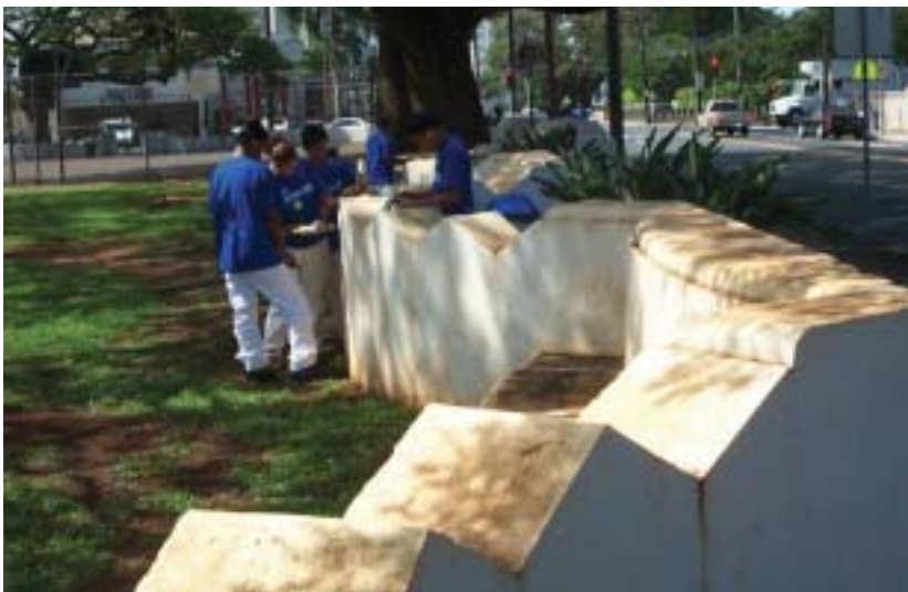
BEFORE: The wall was covered with volcanic dirt and mold & mildew.

With the Hawaii Job Corps, JOMAX and PERMA-WHITE all on the same team, the wall was restored to its original beauty –and now mildew doesn’t stand a chance in the Kawananakoa Playground Neighborhood Park! 🎯