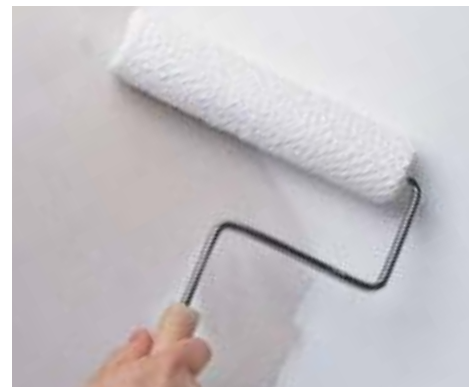
Great for priming high pH surfaces like plaster