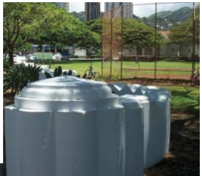
AFTER: The wall is restored to its original beauty with JOMAX and PERMA-WHITE.