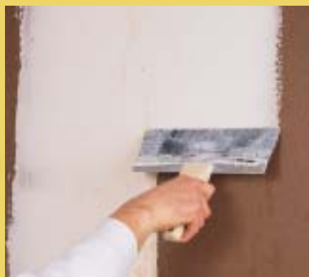
Great under or over any skimcoat