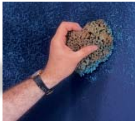
An outstanding first coat for decorative finishes