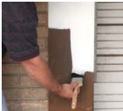
Resists rust flashing/ Inhibits rust formation