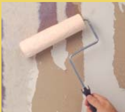
Seals new and damaged drywall and prevents future damage