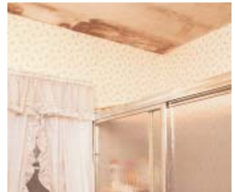
Great for priming mildew-prone areas